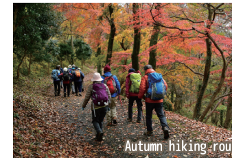
Autumn hiking route