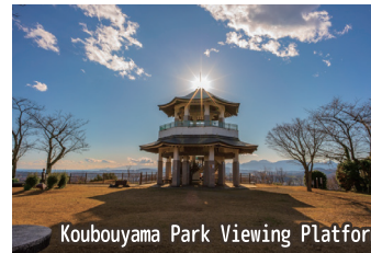
Koubouyama Park Viewing Platform

Walking distance: 8.3km / Walking Time: 2 hours 15 minutes